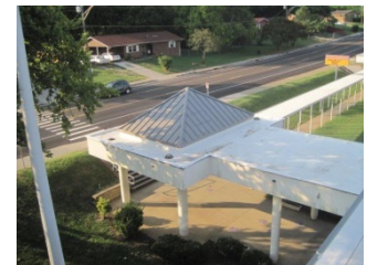
New Roof (Work in Progress)