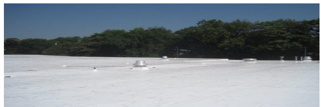
New Reflective White TPO Roof Membrane System