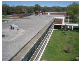
Existing Roof System