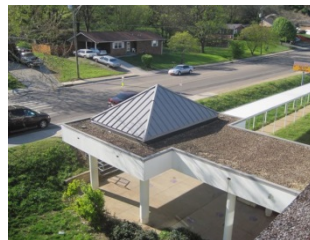
Existing Roof System