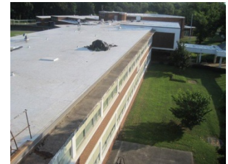
New Roof (Work In Progress)