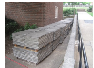
Salvaged Concrete Pavers