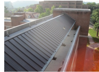
After (Work in Progress)

An infrared thermal moisture survey was conducted on the roof by a third party entity which revealed almost a complete water saturation of the existing roof insulation on the northern end of the building and a partial water saturation of the existing roof insulation on the southern end of the building. The main roof area (originally constructed as a plaza paver roof system) concealed the readings of the infrared thermal moisture survey so roof cores were taken at various locations on the plaza paver area to confirm the wetness of the existing roof insulation beneath the plaza paver roof system.