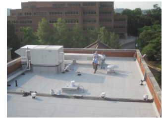
After (Work in Progress)