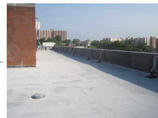
Parapet Wall Flashing Detail

All salvaged material not reused on the project (ex: clay tile roof and concrete pavers) were turned over to the Owner for other uses around the University.