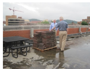
Salvaged Clay Tile Roof

The scope of work included a complete roof system tear-off of the existing EPDM ballasted membrane roof on the north/south and penthouse low-sloped roof areas, as well as the plaza paver roof and replacing it with a new cold-applied 2-ply SBS modified bitumen roof with new tapered insulation.