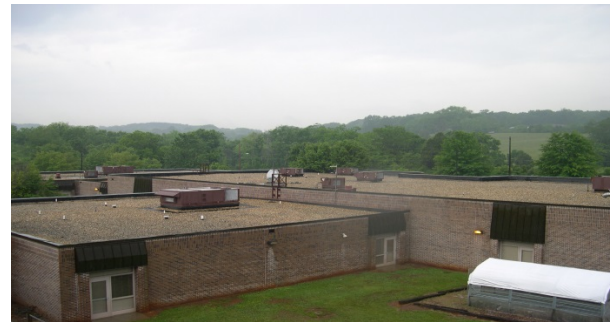
Existing Ballasted Roof

The roof replacement consisted of removing the existing rock ballast and 45 mils thick EPDM membrane, removing/replacing portions of the existing insulation found to be wet or unserviceable, installing a high density coverboard over the existing insulation, attaching the insulation composite to the roof deck, and installing a 60 mils thick fully adhered EPDM membrane for a 20-year roof guarantee.