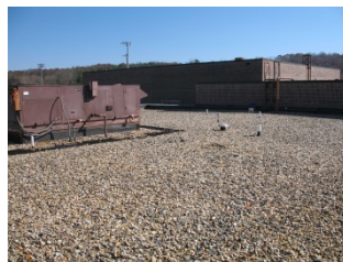
Existing Ballasted EPDM

The EPDM membrane had reached its acceptable service life and it had been bridging at the parapet walls causing splits and tears at the base of the membrane. The school maintenance department attempted minor repairs around the parapet but unfortunately they used an incompatible product for the EPDM membrane which made the condition even worse at the walls and other roof penetrations.