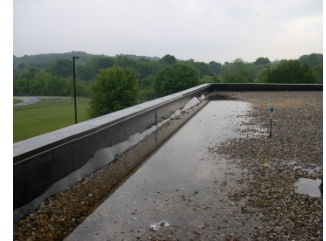
Poor Roof Drainage

Due to limited funding for the roof replacement, Architects Weeks Ambrose McDonald conducted a moisture analysis of the underlying roof insulation to see if it could be retained for the new roof system. The moisture analysis confirmed the existing roof insulation could be retained for the new roof which saved the Owner thousands of dollars.