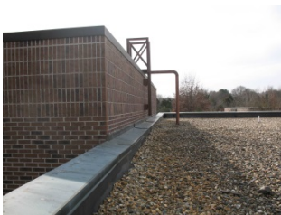
Existing Ballasted EPDM

Lenoir City Middle School had an existing ballasted EPDM roof installed that was difficult to maintain by the school system maintenance department.