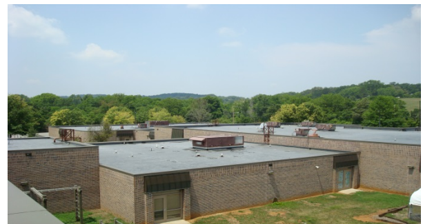
New Adhered EPDM Roof