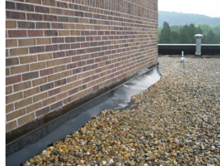
EPDM Membrane "Bridging"

The EPDM membrane had reached its acceptable service life and it had been bridging at the parapet walls causing splits and tears at the base of the membrane. The school maintenance department attempted minor repairs around the parapet but unfortunately they used an incompatible product for the EPDM membrane which made the condition even worse at the walls and other roof penetrations.