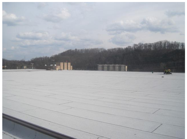
Fleming Warehouse – New Roof (East End)

The scope of work identified in the base bid included a complete roof system tear-off of the existing 4-ply built-up roof on the east end of the warehouse and replacing it with a new cold-applied 2-ply SBS modified bitumen roof with new tapered insulation. Additional work identified in the base bid included damaged deck replacement, abandoned equipment removal, CMU repairs, new metal siding, new metal fascia, new gutters/downspouts, new wall mounted ladders, and painting of the loading dock canopies.