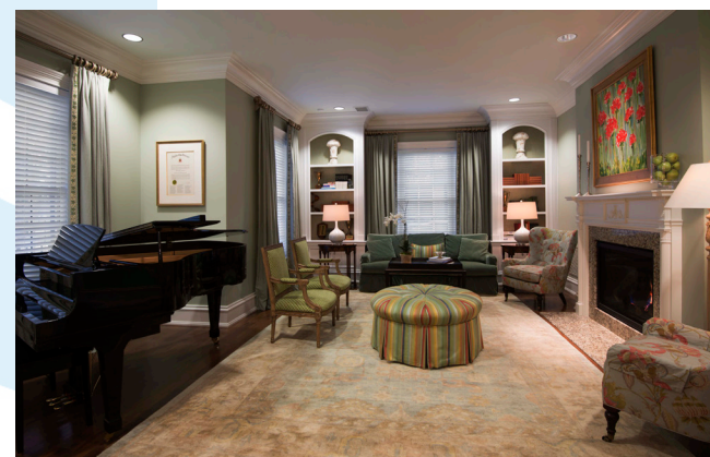
Formal Living Room