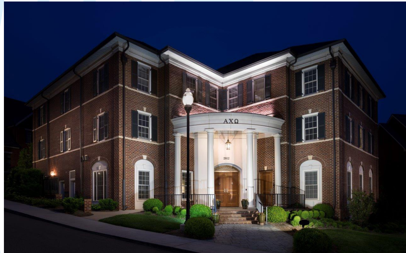
Regency Georgian Style Architecture

AWAM was the Architect of Record and Duane Stone & Associates of Atlanta, Georgia, the Designer for a sorority house in the Morgan Hill Sorority Village. This house is one of 14 sorority houses which replaced the overcrowded Panhellenic Building located in the center of campus. The house is designed in the Regency Georgian style as part of the University guidelines that all the houses be of a “traditional design”. A terrace wraps the back of the house providing an outdoor extension of the Chapter/Dining Room, overlooking the Tennessee River. The 13,076 sf sorority house was completed in 2012 at a total construction cost of $3,375,454 or $203/sf.