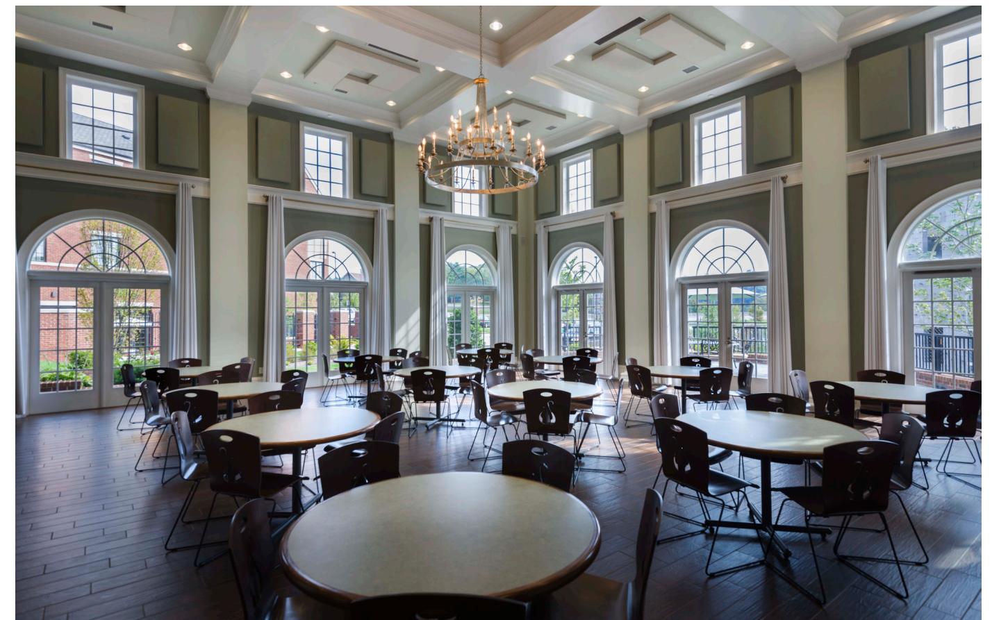
Chapter and Dining Room