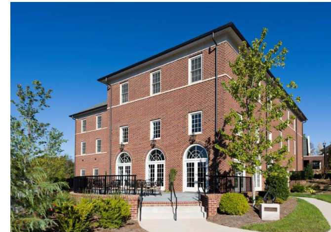
Exterior Rear View

AWAM was the Architect of Record and Duane Stone & Associates of Atlanta, Georgia, the Designer for a sorority house in the Morgan Hill Sorority Village. This house is one of 14 sorority houses which replaced the overcrowded Panhellenic Building located in the center of campus. The house is designed in the Regency Georgian style as part of the University guidelines that all the houses be of a “traditional design”. A terrace wraps the back of the house providing an outdoor extension of the Chapter/Dining Room, overlooking the Tennessee River. The 13,076 sf sorority house was completed in 2012 at a total construction cost of $3,375,454 or $203/sf.