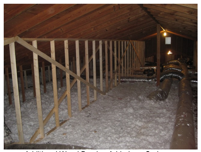
Additional Wood Bracing Added per Code

The existing roof was identified as a 3-tab fiberglass asphalt shingle installed over a 15# felt underlayment on plywood decking. The attic space beneath the existing roof was poorly ventilated which caused premature aging of the existing shingles. The existing attic framing members required strengthening and additional wood bracing to meet current building codes for the new shingle roofing system.