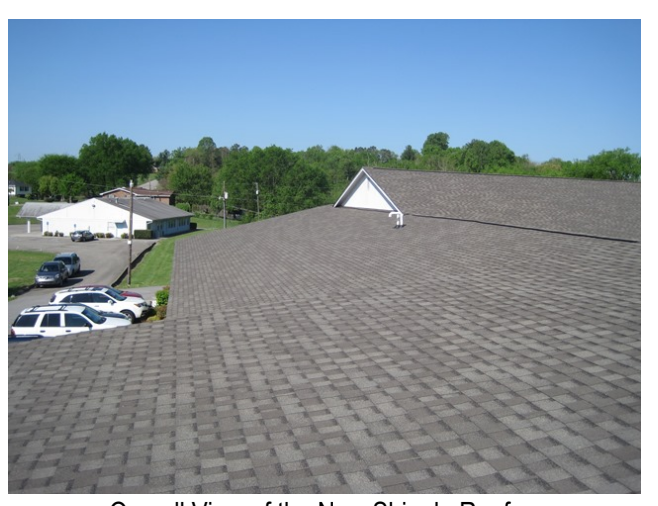
Overall View of the New Shingle Roof