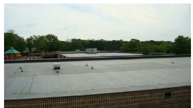
New Fully Adhered 60 Mils Thick EPDM Roof