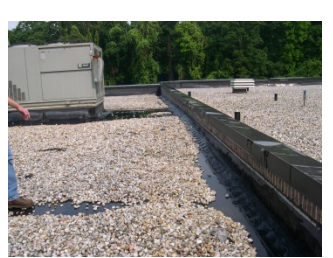
Existing Ballasted EPDM

The EPDM membrane had reached its acceptable service life and it had been bridging at the parapet walls causing splits and tears at the base of the membrane. The school maintenance department attempted minor repairs around the parapet but unfortunately they used an incompatible product for the EPDM membrane which made the condition even worse at the walls and other roof penetrations.