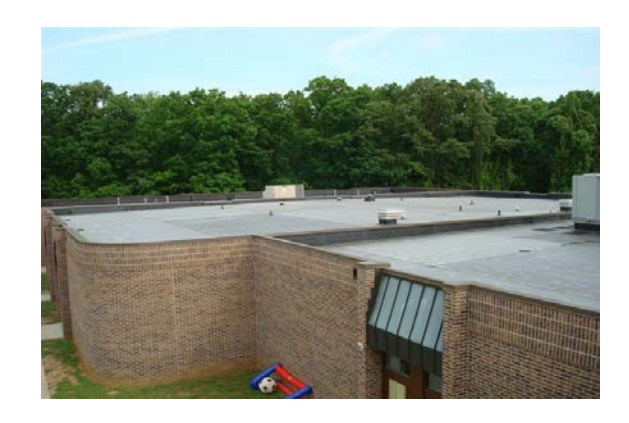
Lenoir City Elementary School Roof Replacement Lenoir City Schools Lenoir City, Tennessee

Lenoir City Elem. Roof Construction Cost $200,015 Cost/s.f. $2.97 Completion Date $2008