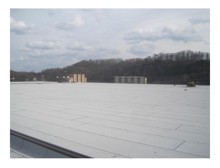
Fleming Warehouse - New Roof (East End)