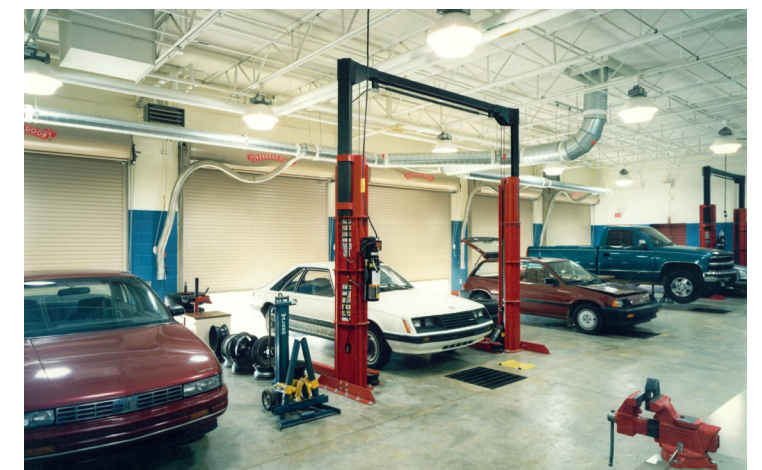
Auto Shop Classroom Space