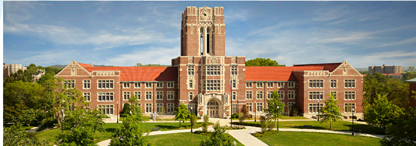
South Facade and Ayres Hall Lawn

"We are proud of the building and the recognition it has received. Ayres Hall exemplifies our commitment to sustainable campus and building practices."