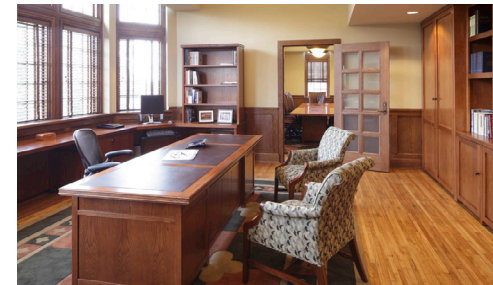
Dean's Suite Office