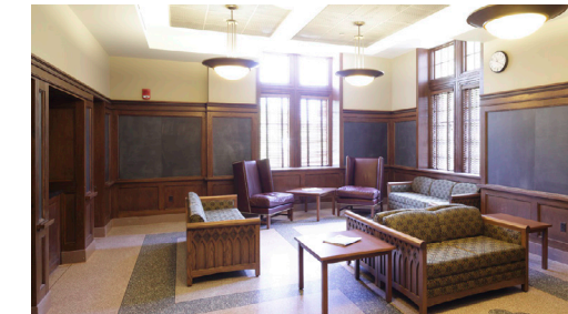
Student Collaborative Space

A façade lighting system highlights the main tower, creating the "beacon shining bright" that is immortalized in the University's alma mater.