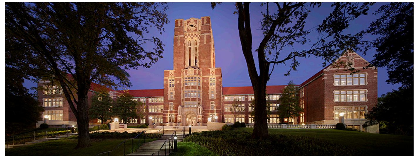
"Beacon Shining Bright"