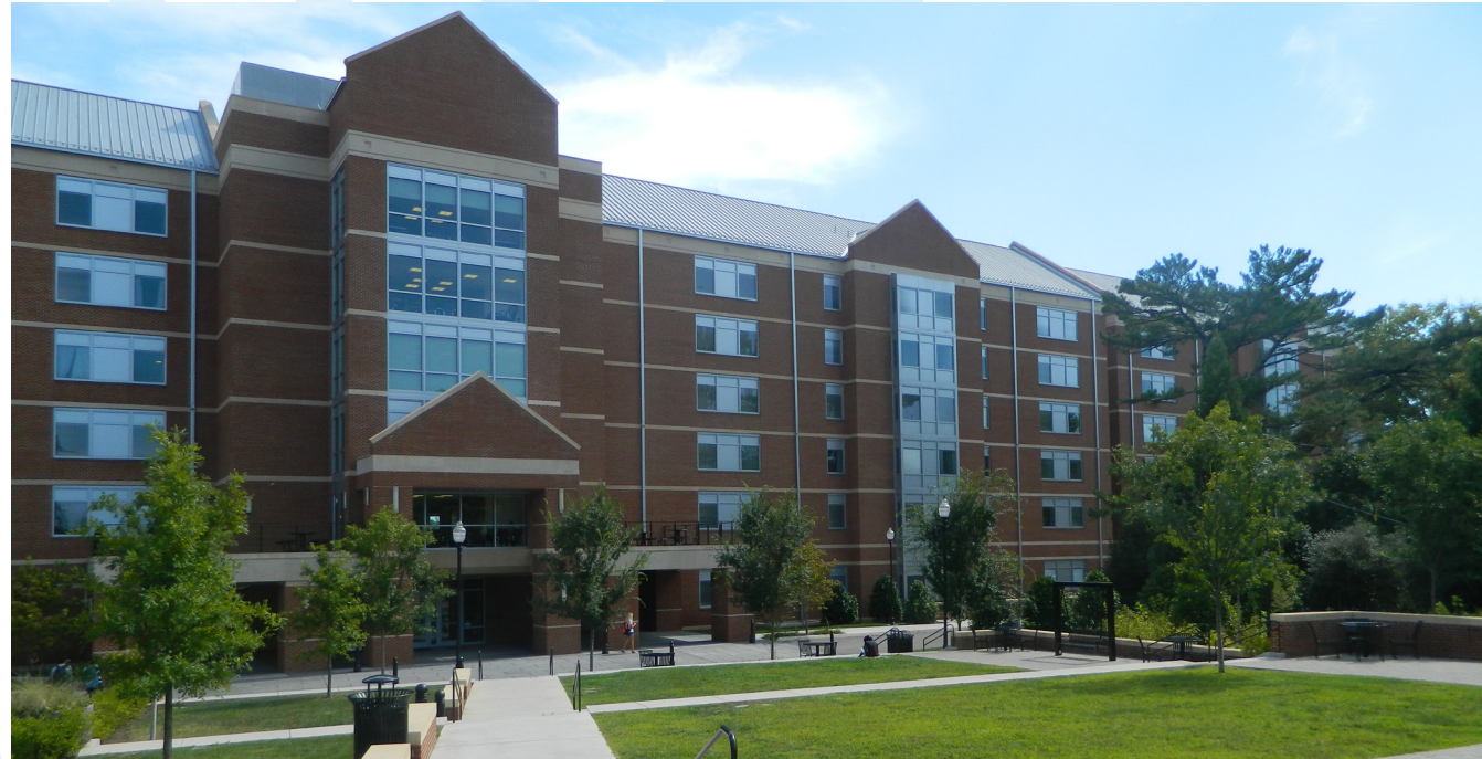
North Facade and Plaza