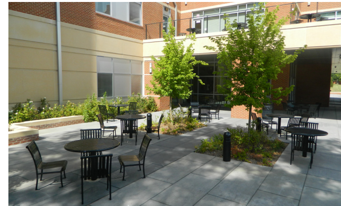
Southwest Outdoor Dining Space

Other residence hall amenities include classroom and seminar spaces, exercise room, game room, collaborative study areas and laundry facilities. Using a fast track multiple bid package format, the new residence hall was designed with a construction management delivery process allowing for the new dormitory to be completed sooner for student occupation. The 245,000 sf building was completed in 2014 at a cost of $206/sf ($72,266/bed) for a total cost of $50,586,073.