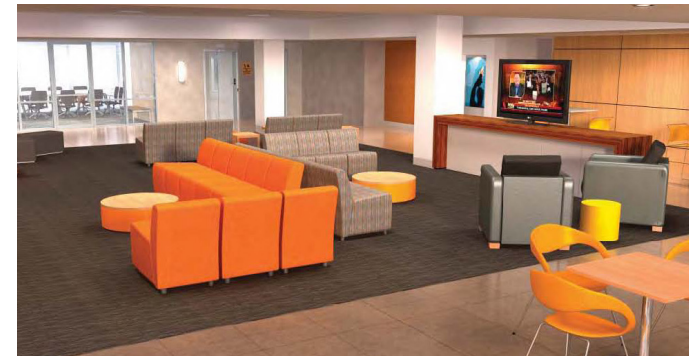
Residential Level Living Room

Other residence hall amenities include classroom and seminar spaces, exercise room, game room, collaborative study areas and laundry facilities. Using a fast track multiple bid package format, the new residence hall was designed with a construction management delivery process allowing for the new dormitory to be completed sooner for student occupation. The 245,000 sf building was completed in 2014 at a cost of $206/sf ($72,266/bed) for a total cost of $50,586,073.