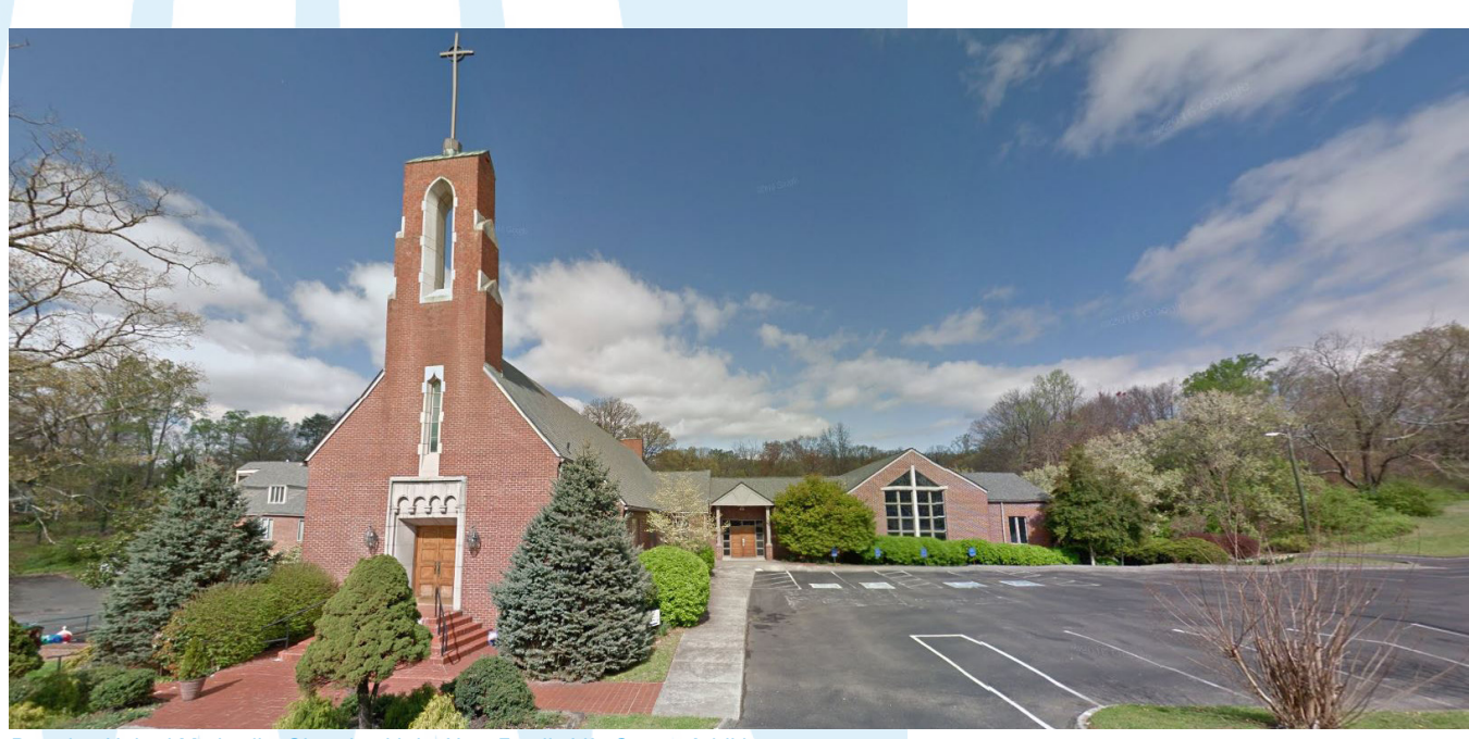
Bearden United Methodist Church with its New Family Life Center Addition

AWAM was retained to develop a master plan for the six acre site of a growing West Knoxville Church. A plan was developed to incorporate future additions and renovations to the existing two story 1950's sanctuary and education wings for education space, a family life center and parking. The first phase included the family life center addition and additional parking. The two-story family life center is attached to the existing sanctuary building via a grand entrance foyer with a covered entries at both levels.